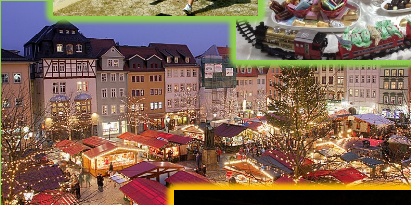
Christmas market in Germany