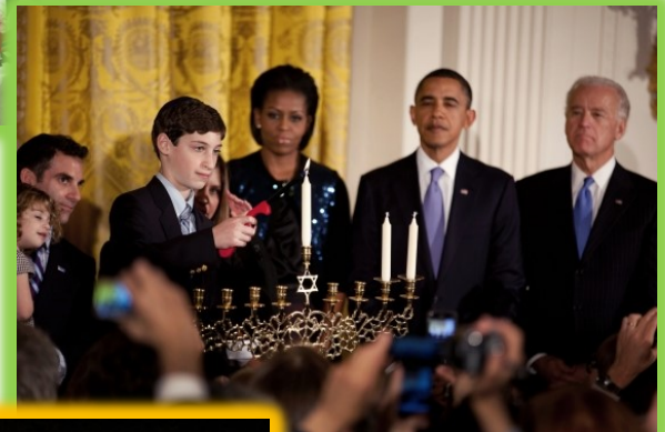
Hanukkah with President Obama