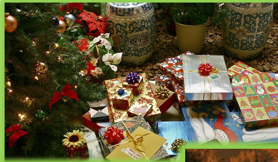
Christmas gifts in the US