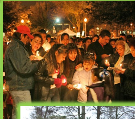
Los Posadas carolers in Mexico