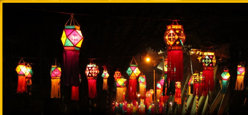
Diwali lanterns in India