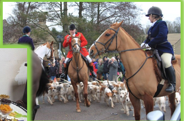
Boxing Day hunt in the UK